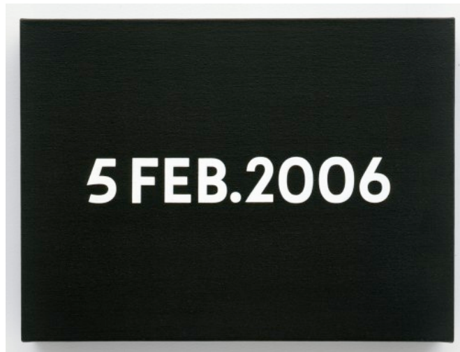
On Kawara 5 FEB. 2006, 2006 from Today Series, No. 4, 1966- "Regardi la teron kun kosma konscio." (To view the earth with cosmic consciousness.) Liquitex on canvas 10 1/2 x 13 1/2 inches 26.7 x 34.3 cm (b) signed verso